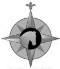
Compass Rose Farm